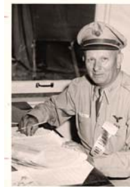
1946: Wearing his Civil Air Patrol uniform during the Muskegon County Airport Dawn Patrol on August 25, 1946. This photo was taken in his office on the North East side of the Airport.